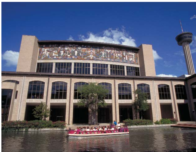
The Henry B. Gonzalez Convention Center along the San Antonio River.

Mukesh D. Ambani , Chairman & Managing Director, Reliance Industries Limited, India will present his viewpoints on the current conditions of the petrochemical industry in Asia, especially India.