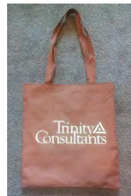
Company logo on outside of bag