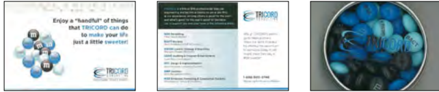
Sample room drop idea