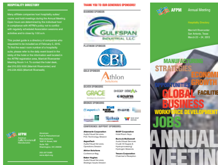
Ad on the back of brochure (center panel) that will be distributed to all attendees at registration