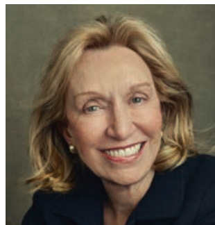
Doris Kearns Goodwin

Recipient of the AFPM Leadership Award U.S. Senator (R-Texas)