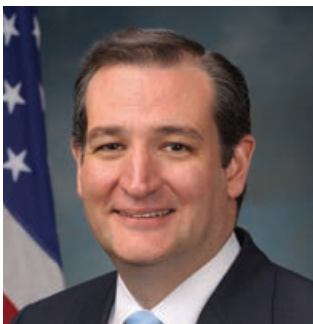
The Honorable Ted Cruz

Chris Wallace, award-winning veteran journalist and host of FOX News Sunday, breaks down today's top news issues impacting individuals and industry, leaving audiences with takeaways that prepare them for impending changes in the political landscape. Chris has established himself as a battle-tested media presence, an incisive, thoughtful interviewer, and a venerable authority on presidential history and election politics.