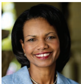
The Honorable Condoleezza Rice

66th Secretary of State of the United States