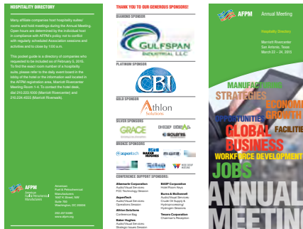
Ad on the back of brochure (center panel) that will be distributed to all attendees at registration