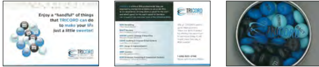
Sample room drop idea