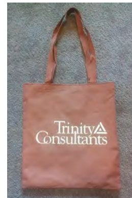
Company logo on outside of bag