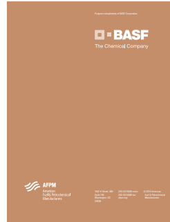
Logo on outside back cover