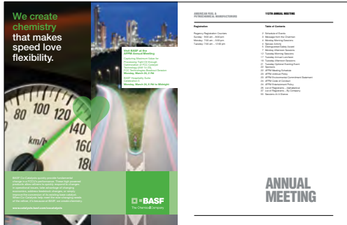
Ad on inside front cover